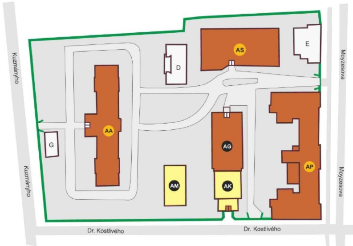
AS = Small Congress Center (ground floor), Moyzesova 9